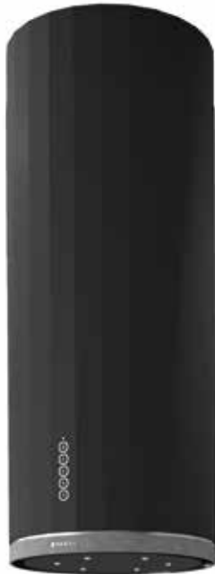
DG MATT/CONCRETE Dark grey matt/Concrete