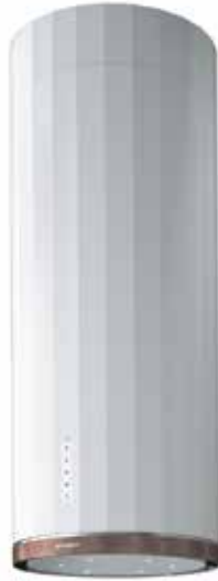
WH MATT/TS White matt / Tibetan silver