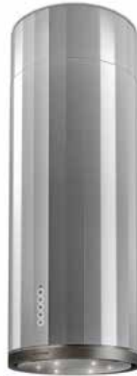
X/OM Stainless steel / Old metal